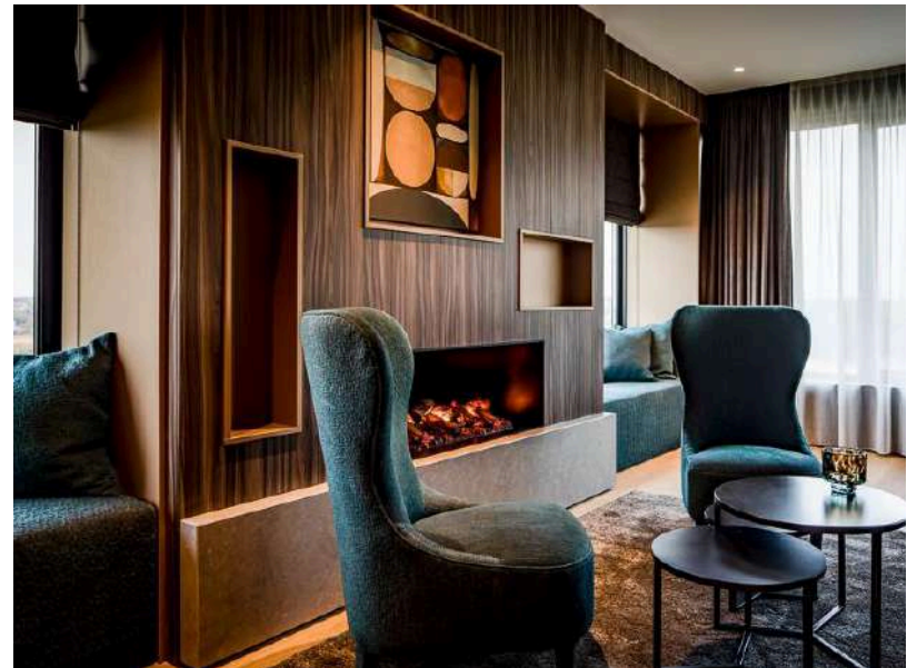
Hôtel Mademoiselle in Val d'Isère