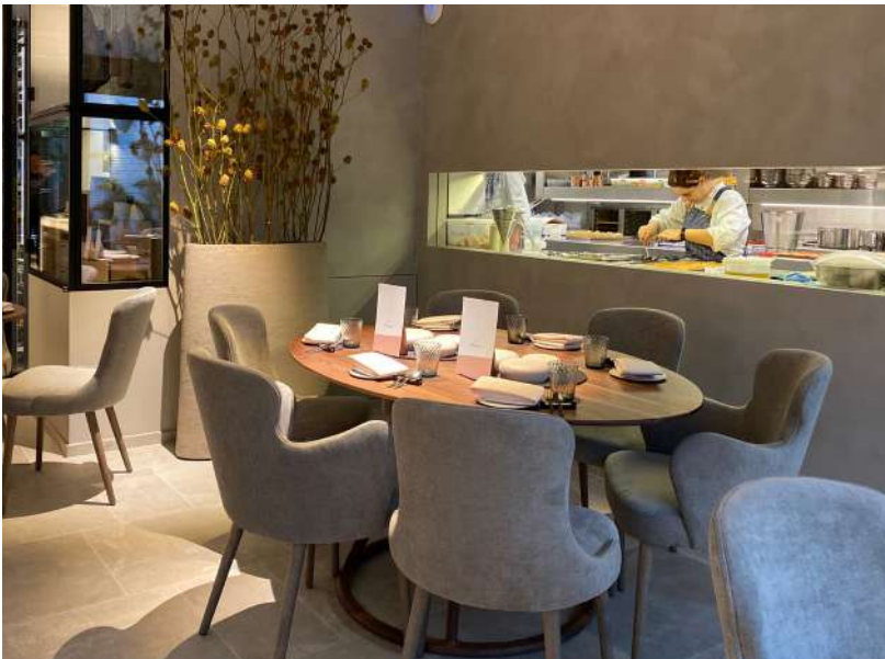
Restaurant Caillou in Knokke-Heist